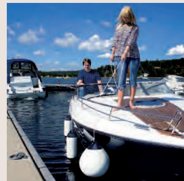
From the largest to the smallest, the Polyform A-series are always reliable.