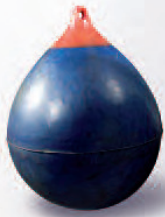
The world's first inflatable plastic buoy.